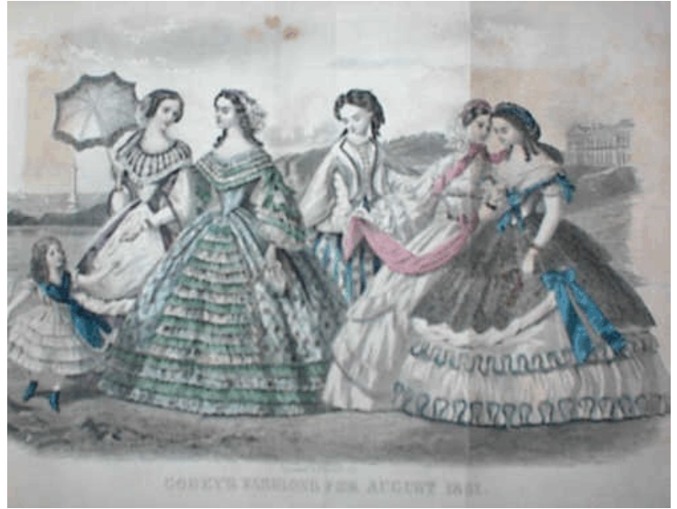
Godey Lady's Book, Fashion Plate for August, 1861